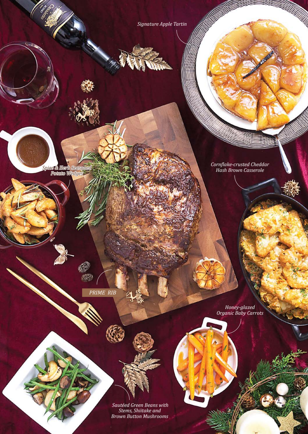
Signature Apple Tartin