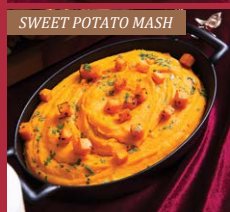
SWEET POTATO MASH